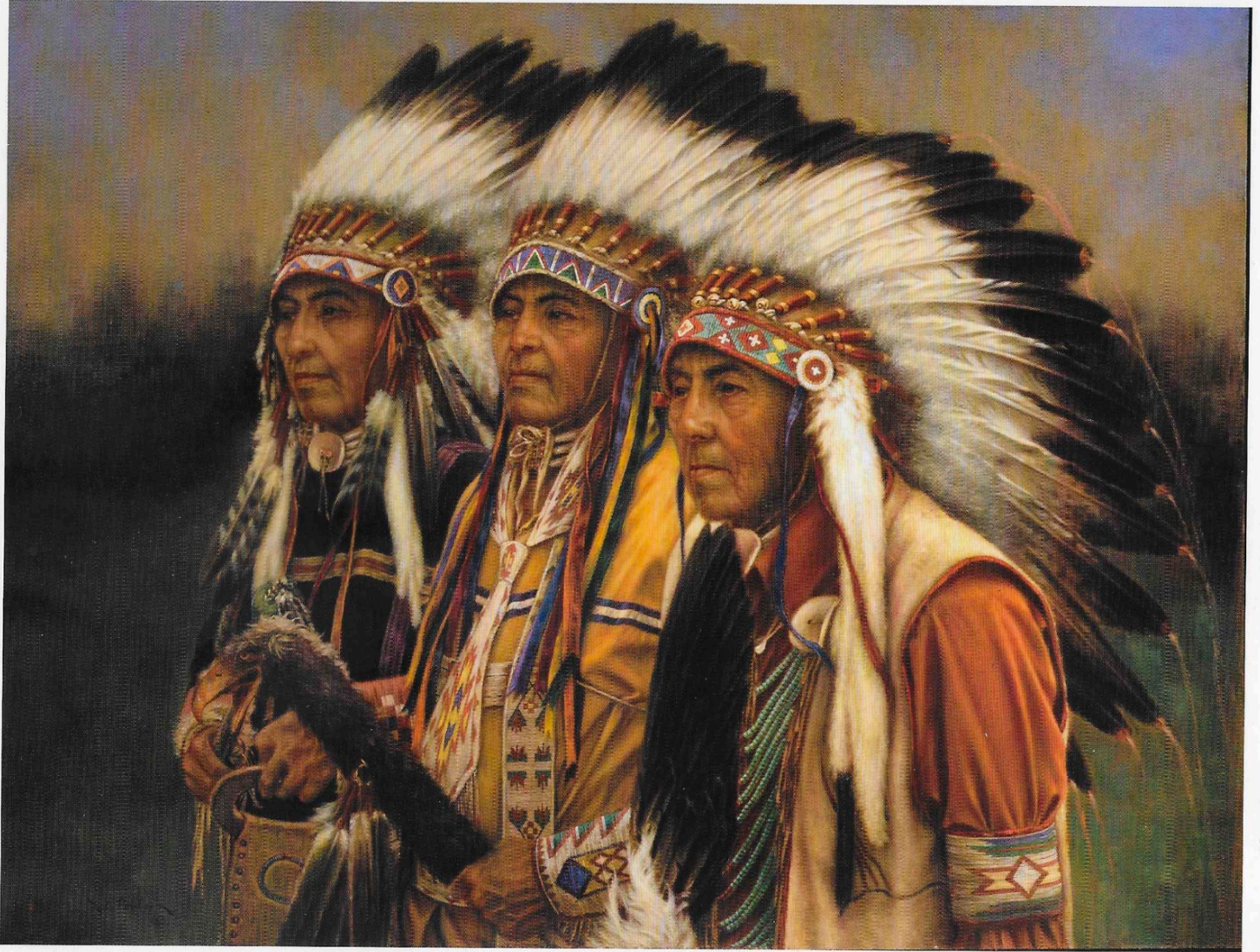
Ancient Echoes. Oil on board. 36" × 40". 2005.